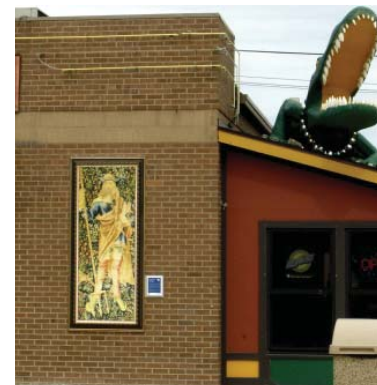
DIA's Inside|Out art exhibit at the Bayou Grill