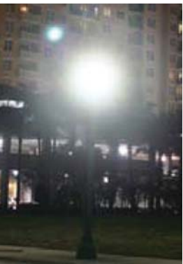
View of a 175W Post Top Light