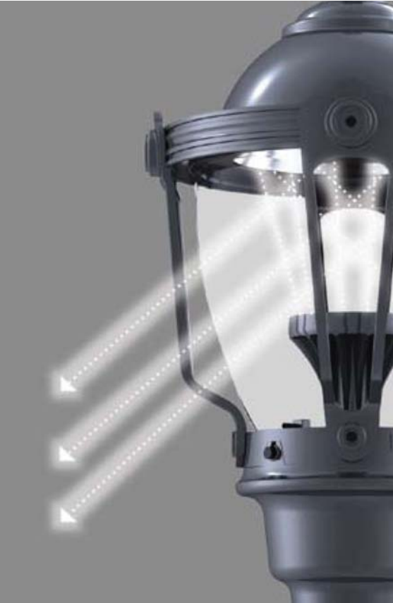
Each LED application can be custom designed

While the City's investigation is not complete, if you see changes to the lights on Main Street next year, rest assured that the City has found another way to stretch the ever-shrinking taxes you pay, to help deliver the same service for a lower cost.