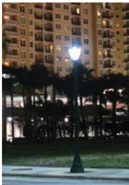
View of a 48W LED Post Top Light