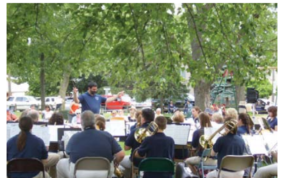
Downtown Belleville Events