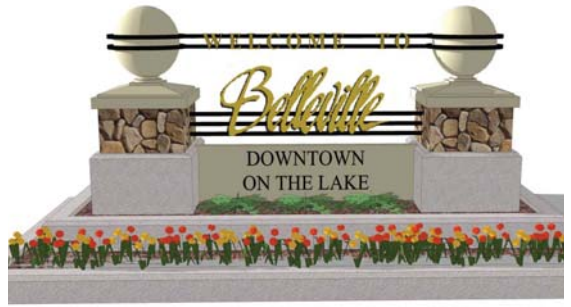
New signs, façade, and parking around Downtown Belleville