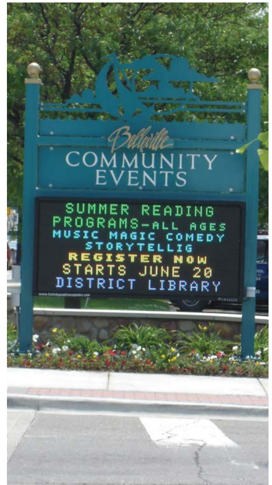
New Community Events sign