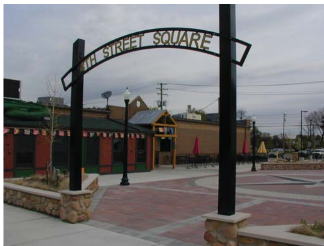
Completed 4th Street Square