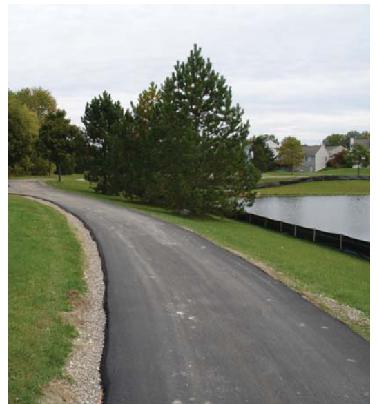
Paved walking path in Village Park